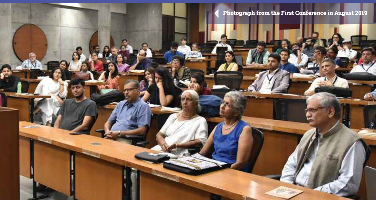
◀ Photograph from the First Conference in August 2019