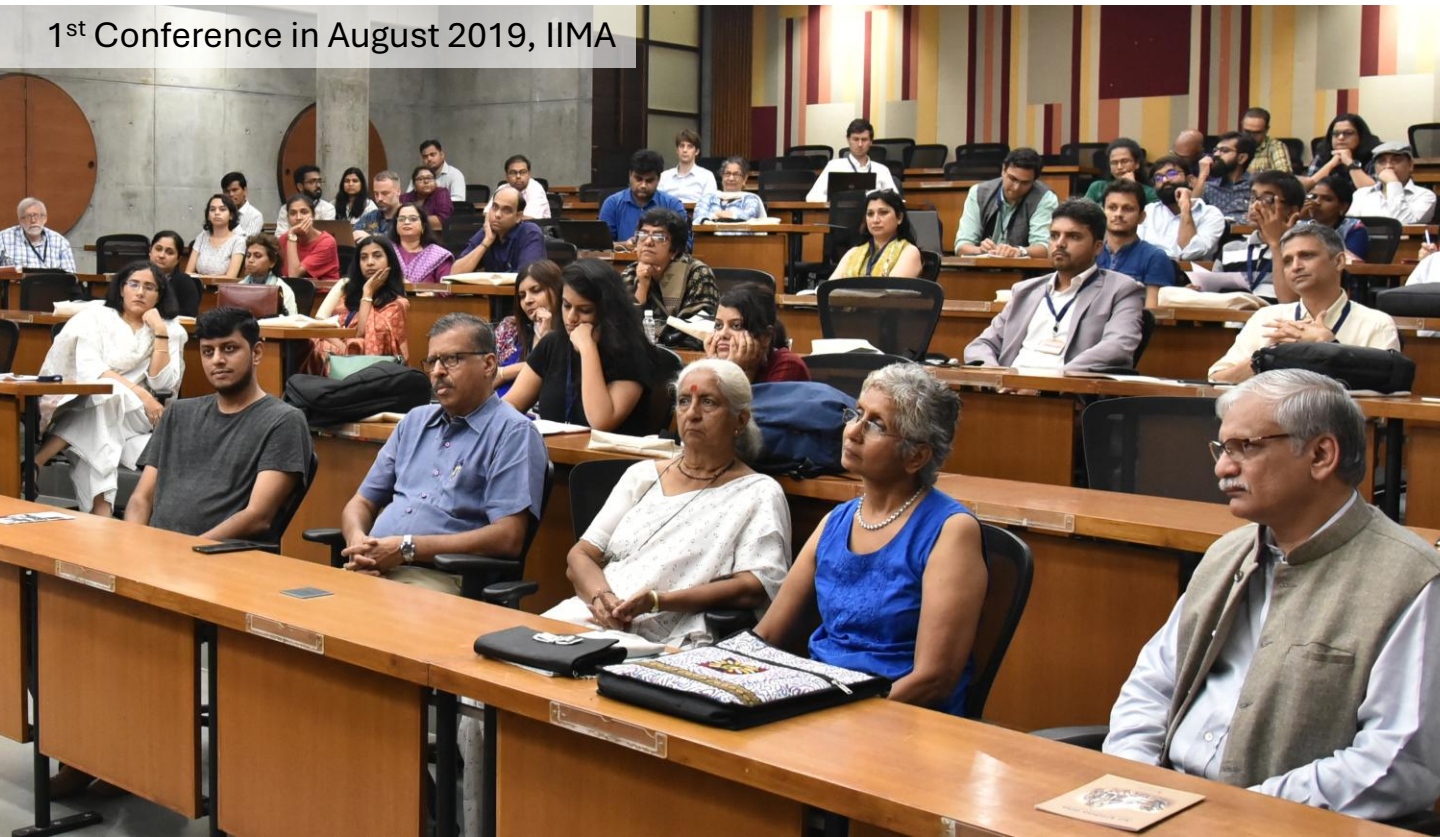
1 st Conference in August 2019, IIMA